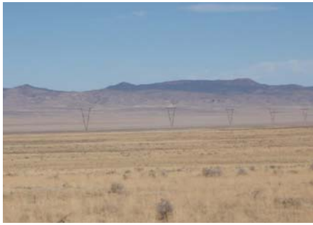
The transmission line is barely visible from any main roadway. The high reliability of IMPLO technology is ideal for averting future maintenance troubles in such an isolated area.