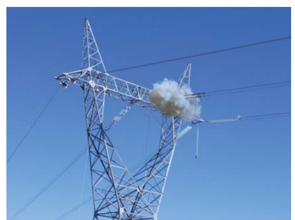
Three IMPLO deadends are installed at the end of the glass insulator string. The multi-unit installation is safe and saves significant time, reducing overall project time to completion.

When accounting for the vastly improved reliability of IMPLO technology versus any other alternative, the long-term future prospects are high for this environment to remain "green," even when that color is absent.