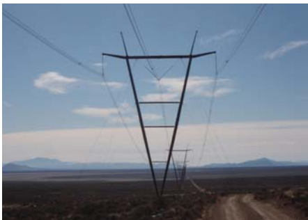
The unique design of this 500kV line consists of 3-bundle 1590 ACSR non-spec conductor.