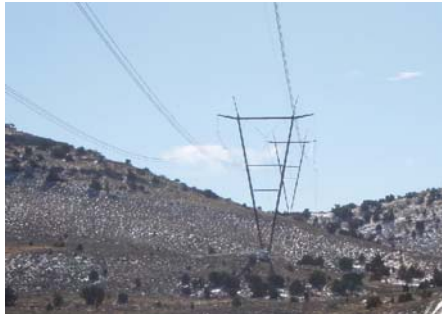
Although not often associated with a desert, the high altitude and accompanying low temperature supports snowfall in the winter months.