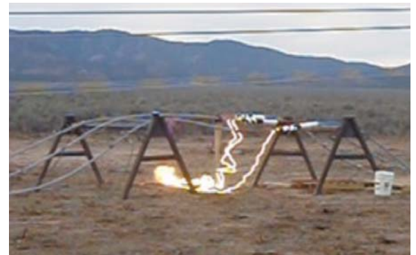
The non-electric initiating signals into these three splices are briefly visible through the shock tube. The installation process is very safe and environmentally friendly.